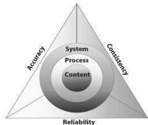
Figure 1. Data integrity scheme.

Security goals cover three points such as availability, confidentiality, and integrity [7].A Understanding data integrity broadly refers to the confidence of resource system. Data integrity is paramount because it can ensure the data accuracy, consistency, accessibilities, and the high quality. Following the integrity rules is important. Data with integrity is identical on hold during any operation such as business transfer, storage or retrieval. In simple computer terms, data integrity is the assurance that data is consistent, certified and referenced. Data integrity means that the accuracy and correctness. Data integrity in a database system must be maintained to keep the truth of the stored data. Figure 1 illustrate the scheme of data integrity.